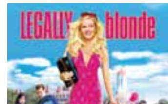
Reese Witherspoon is "Elle Woods"

It's never easy to decide between Adams and Macht in Suits. No matter who nominated this show for these actors, it was consistently unclear who was more deserving of "celebrity crush status". Suits is about a brilliant man who never graduated or attended law school (Adams), yet convinces a partner at one of the biggest NY law firms (Macht) to hire him anyway. The show ran from 2011 to 2019 and even had its own spinoff. Both are charming, and their characters make you connect emotionally to them, which makes this duo a hard crush to top!