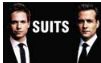
Patrick Adams vs. Gabriel Macht in "Suits"

wrongfully imprisoned or improperly represented. Jordan shines through with his intensity and charm. In the hierarchy of celebrity crushes, Jordan is tough competition.