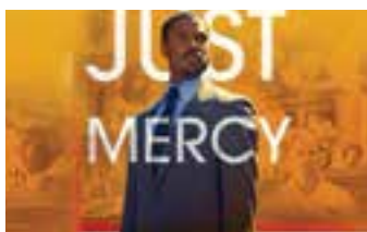
Michael B. Jordan in "Just Mercy"

At times, we legal professionals can be hard to love. Whether talking, arguing, or billing too much, we are the porcupines of professionals: prickly on the outside, cuddly on the inside. But Hollywood gets us, and shows it through the sexy actors/actresses they cast as legal professionals. With this in mind and love in the air, here