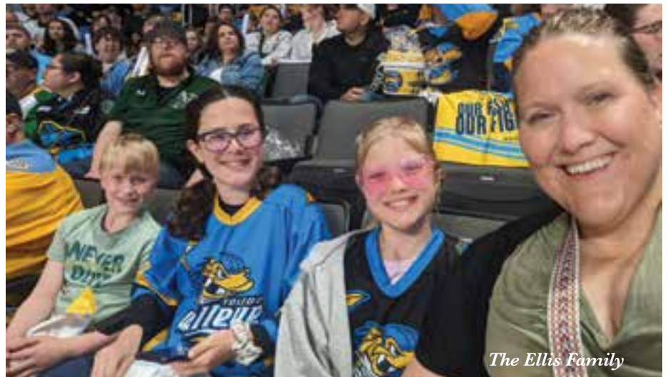
The Ellis Family

If you have cancer, are a survivor, or are caring for someone with cancer, call 419-531-7600 or visit their website at www.thevictorycenter.org