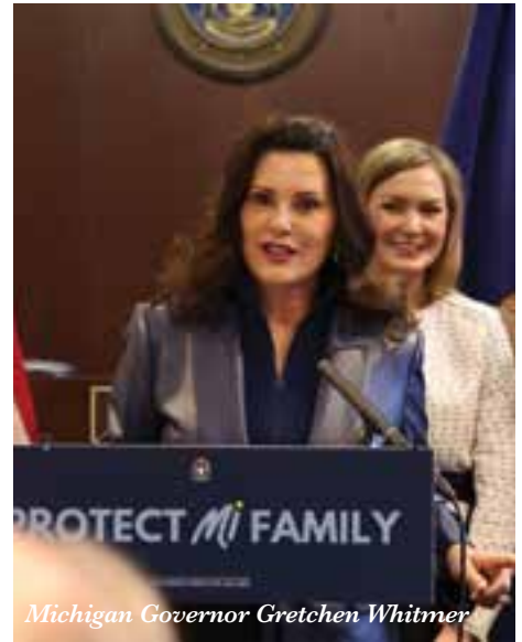
Michigan Governor Gretchen Whitmer