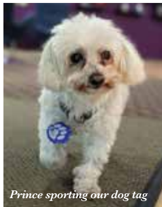
Prince sporting our dog tag