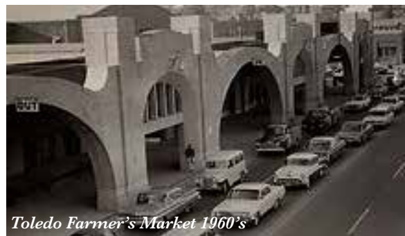
Toledo Farmer's Market 1960's

In 1928, a building on Erie Street was remodeled to function as a