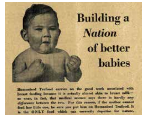
Vintage Formula Ad

If you believe your baby was harmed by contaminated formula, contact Charles Boyk Law Offices. Our attorneys may be able to help you.