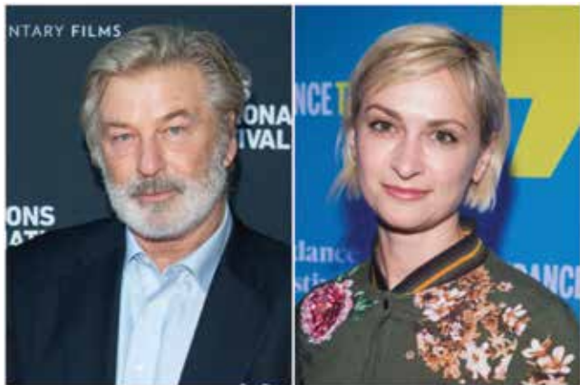
Alec Baldwin and Cinematographer Halyna Hutchins

While filming a movie in New Mexico, Alec Baldwin was handed a loaded firearm, which he discharged, killing a forty-two-year-old cinematographer, who happened to be a mother. The discharge also injured one of the directors of the movie.