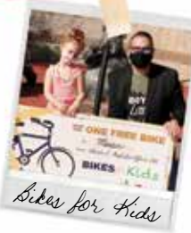
Bikes for Kids