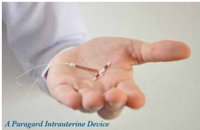
A Paragard Intrauterine Device

Any woman experiencing adverse side effects after using the Paragard Intrauterine Device (IUD) for contraception should consult with their medical provider quickly.