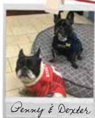
Penny & Dexter