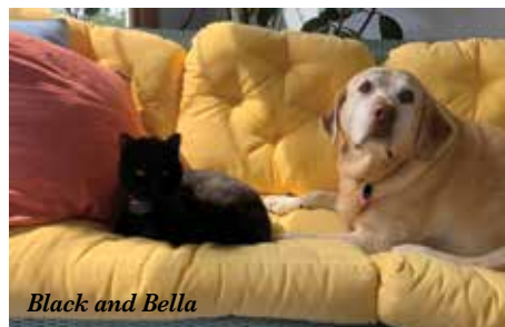
Black and Bella