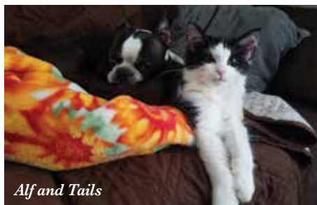
Alf and Tails