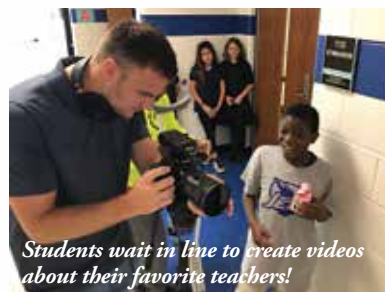
Students wait in line to create videos about their favorite teachers!

As you can imagine, the kids, whose ages ranged from five to fourteen, had hilarious answers and the videos are available to watch on our website, www.TPSProud.com . From those videos, we will choose one teacher to win a $150 Visa gift card and the creator of the video will receive a $50 Visa gift card. The teachers are also currently nominating kids for Student of the Month and the winner will receive a $150 Visa gift card. Stay tuned to learn the winners and for more videos from our next TPS elementary, Rosa Parks Elementary!