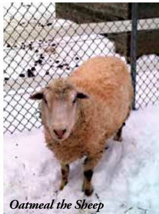
Oatmeal the Sheep