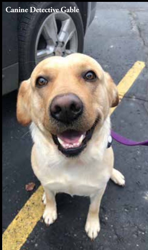
Canine Detective Gable