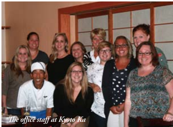
The office staff at Kyoto Ka