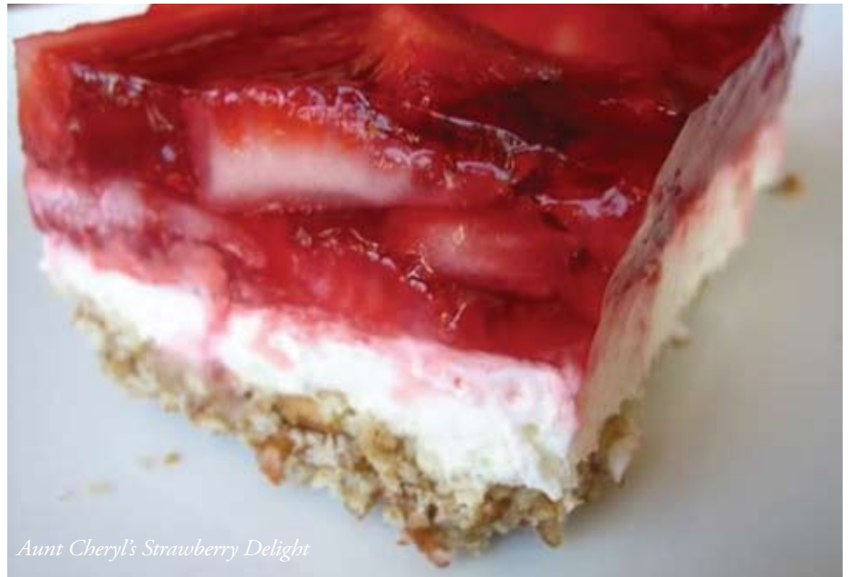
Aunt Cheryl's Strawberry Delight

3. For strawberry topping, dissolve gelatin in boiling water in a large bowl. Stir in strawberries and chill in the refrigerator until partially set. Carefully spoon over cream filling, and then chill for 4-6 additional hours, or until firm. Cut into squares, serve and enjoy! Option for berry lovers: Substitute raspberry instead of strawberry for a different twist!