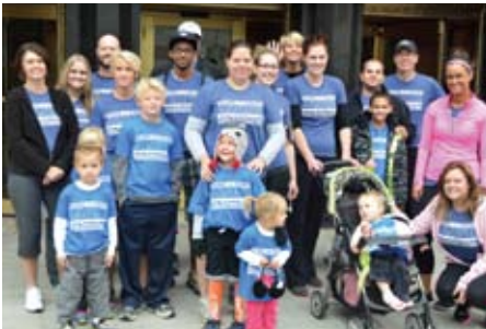
The 2013 Boyk Law Race for the Cure team

Pounding the pavement once again, the Boyk Law Team and their families took to downtown Toledo to tackle the 3.10 mile Race for the Cure run/walk. Holding umbrellas and pushing strollers, they endured the rain before meeting back in the office for a big breakfast. We are always looking for people to join our Race for the Cure each September, so please remember us next year!