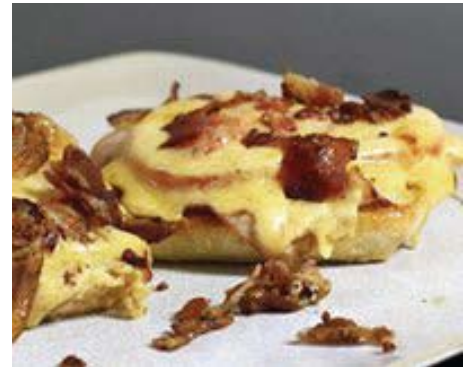
Serves 4 to 6.