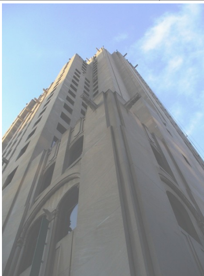
National City Bank Building encourage you to call with any questions.