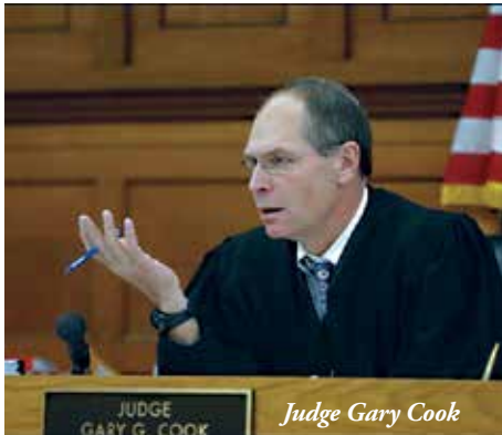
Judge Gary Cook

Judicial races are some of the most important each election cycle, but due to the strict campaign rules on judicial candidates and the highly-publicized, more glamorous campaigns that are occurring at the same time, they are often forgotten. Boyk Law takes local judicial races very seriously, as the candidates that are elected shape the landscape of our legal work for years to come. That is why we've decided to share with readers our picks for the judicial races which could appear on your ballot on November 8th.