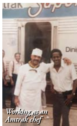
Working as an Amtrak chef