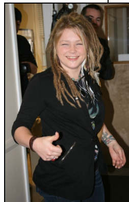
Crystal Bowersox at the Kiss FM studios

An Elliston, Ohio native, Crystal was American Idol's first runner up, ranking second place next to Lee DeWyze.