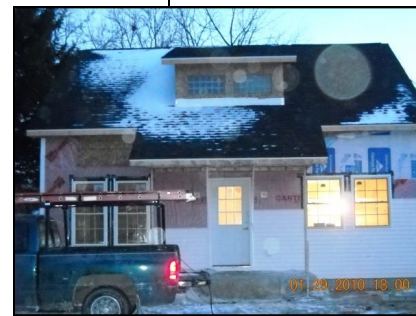
Lupe's new home, almost complete