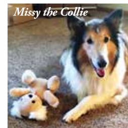
Missy the Collie

while we were at Briar and she loves to visit people there. As soon as we make the turn to pull in to Briar Hill, she gets so excited."