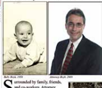
Surrounded by family, friends, and co-workers, Attorney