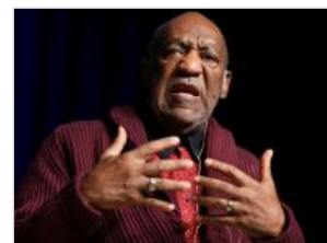
Lawyers: Cosby's drugs-sex admission could aid women's cases