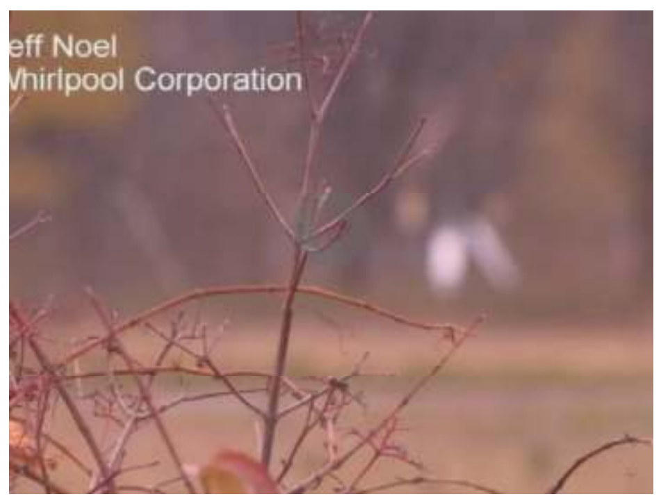
Clyde cancer cluster meeting WEWS

BY: Associated Press POSTED: Mar 28, 2013 UPDATED: 280 days ago