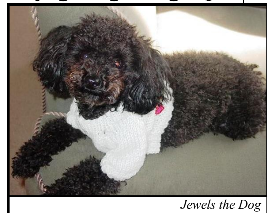
Jewels the Dog

8. Don't be afraid to talk to your wife or girlfriend's friends. Not only will contacting them for ideas help you decide what to buy, but you might just score brownie points with them for being a thoughtful guy.