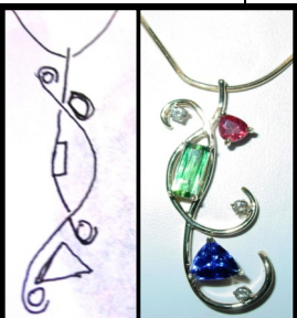
From the sketch to the final product

Tuesdays 11-7, Wednesdays, Thursdays, and Fridays 10-6, and Saturdays 10-4. Appointments are welcome outside of normal business hours and can be made by calling 419.882.3121.